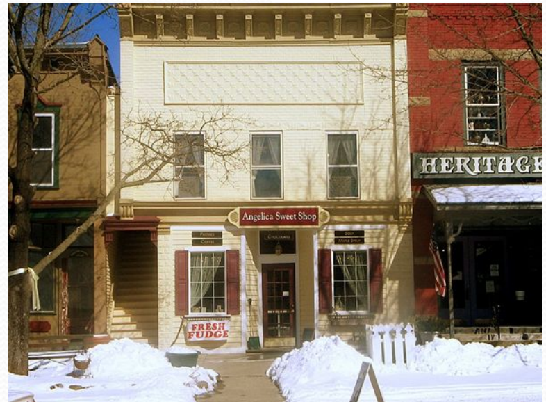
Angelica, NY : Angelica Sweet Shop 5