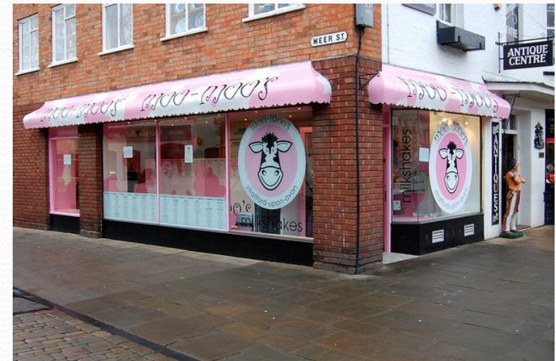
Moo-Moo's Milk Shake Shop 4