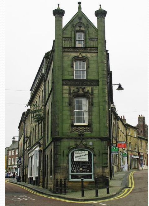
The Tall Green Shop