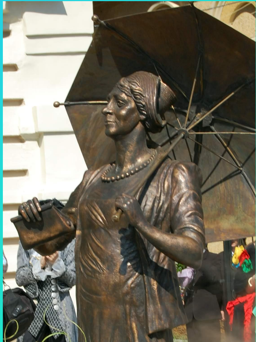
F. Ranevskaya`s monument