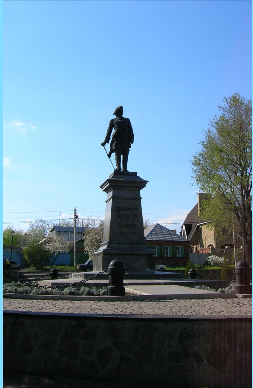
Peter the First's monument