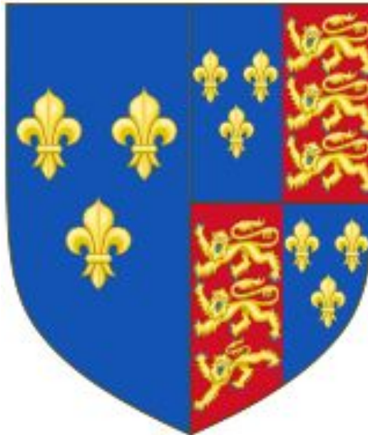
House of Lancaster