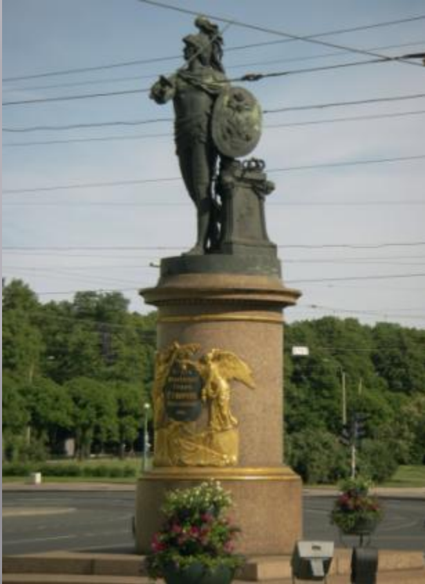
Monument near Troickij bridge