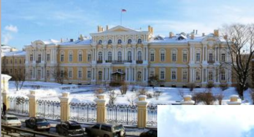
In St. Petersburg

During the Great Patriotic war special schools were established. These schools were named after Suvorov the Suvorov Schools.