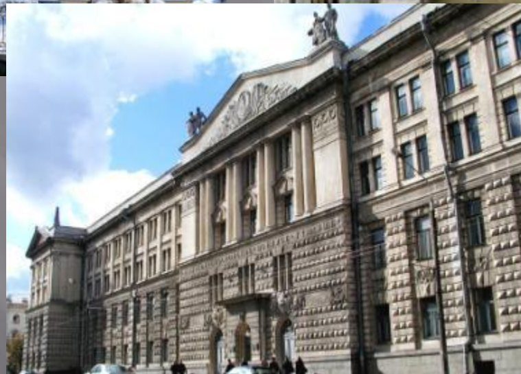
Minsk Suvorov Military School