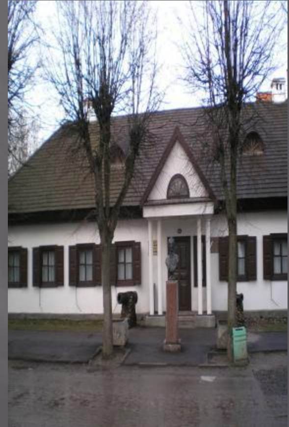
Suvorov Museum in Kobryn