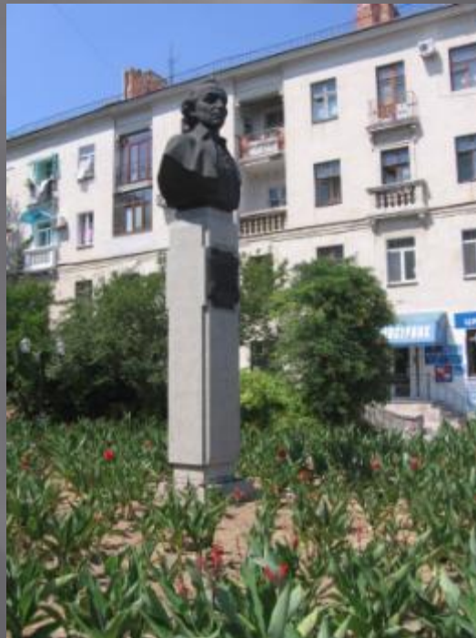
Monument in Sevastopol