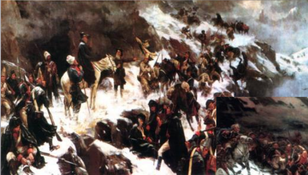
Crossing through the Alps