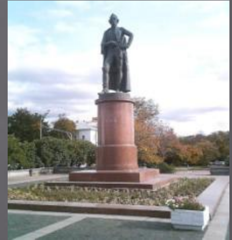
Monument in Moscow