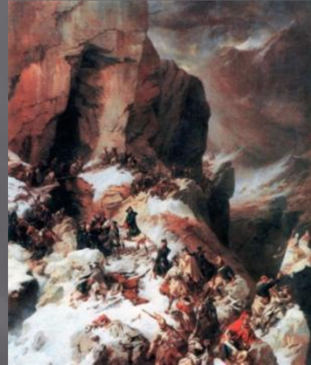
Crossing through Paniks in 1799

When Suvorov battled his way through the snow-capped Alps his army was checked but never defeated.