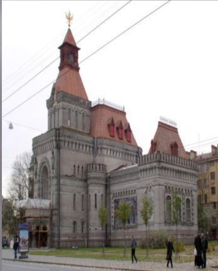
Suvorov Memorial Museum in Saint Petersburg