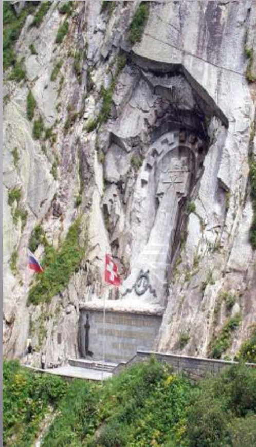
Suvorov monument in the Swiss Alps