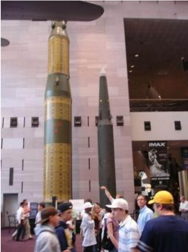
Soviet SS-20 and U.S. Pershing II rockets