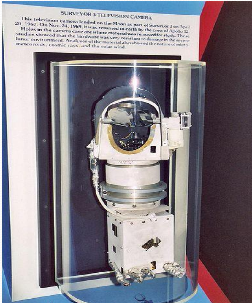
The Surveyor 3 camera