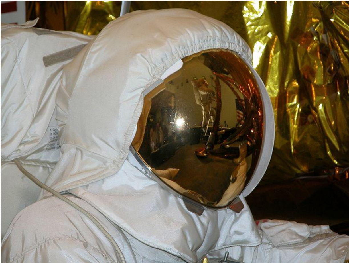
Lunar space sui