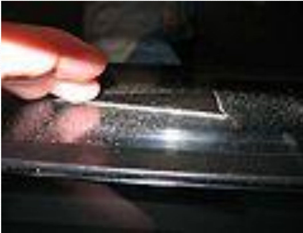
Moon rock from Apollo 17