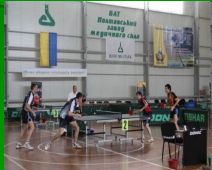
table tennis lawn tennis

Tennis is also very popular in Britain. Two different games that do not have much in common bear the name of tennis - lawn tennis and table tennis. Both games first appeared in England, but today the British prefer lawn tennis to table tennis. Every summer, in June, the biggest tournament in the world takes place at Wimbledon. This world centre of lawn tennis is located in a suburb of London. Millions of people watch the Wimbledon Championship on TV. Table tennis originated in England in 1880. But the British players are not lucky in table tennis international championships