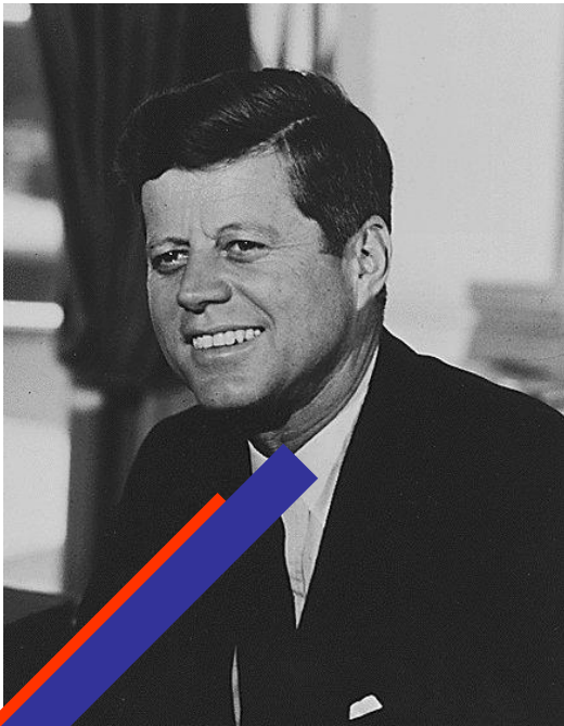
John F Kennedy 1961-63