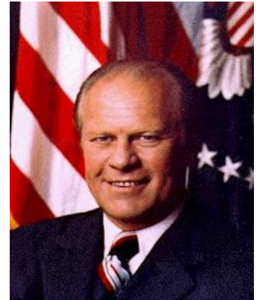
Gerald Ford 1974-77