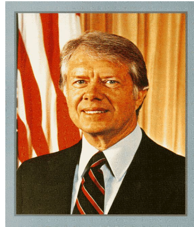
Jimmy Carter 1977-81