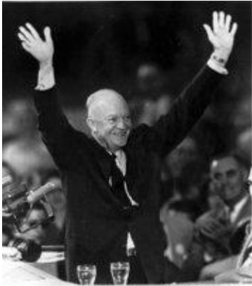
Dwight Eisenhower 1953-61