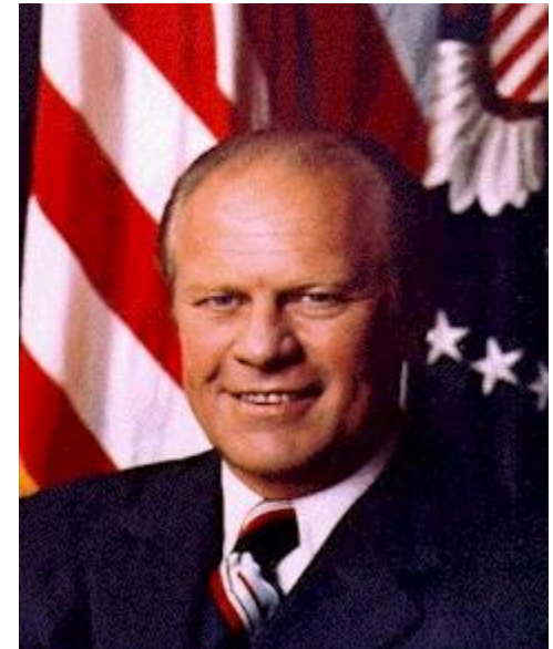
Gerald Ford 1974-77