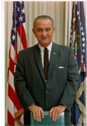
Lyndon B Johnson 1963-68