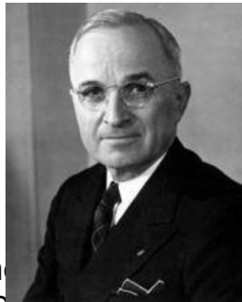
The President of the USA Harry Truman 1945-53