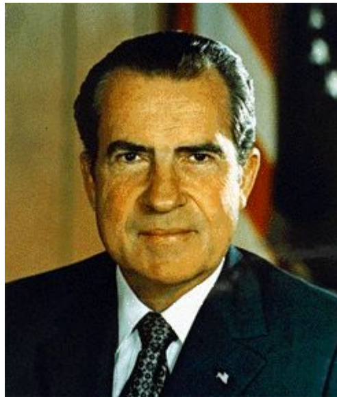
Richard Nixon 1969-74