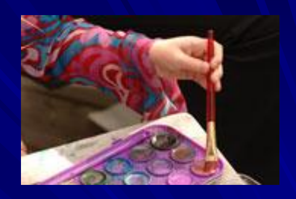
Free time Leisure activities Spare time Recreation