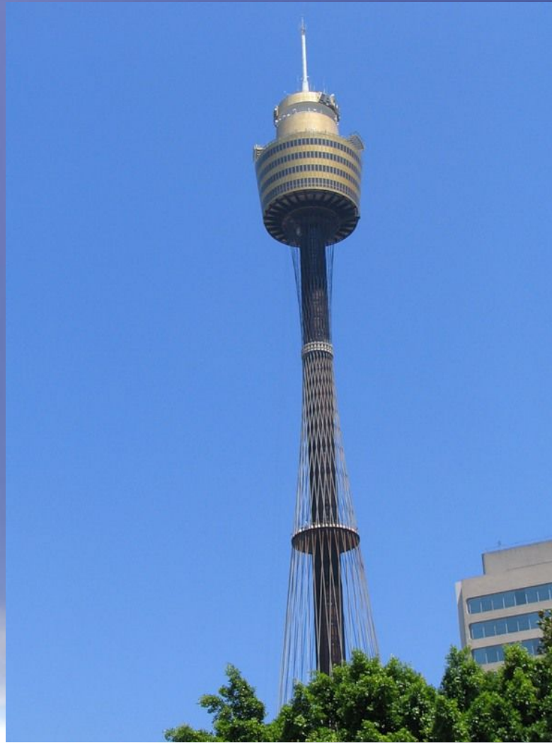
The Sydney Tower