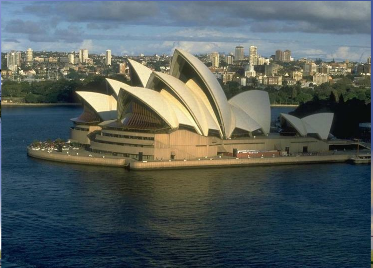
The Opera House