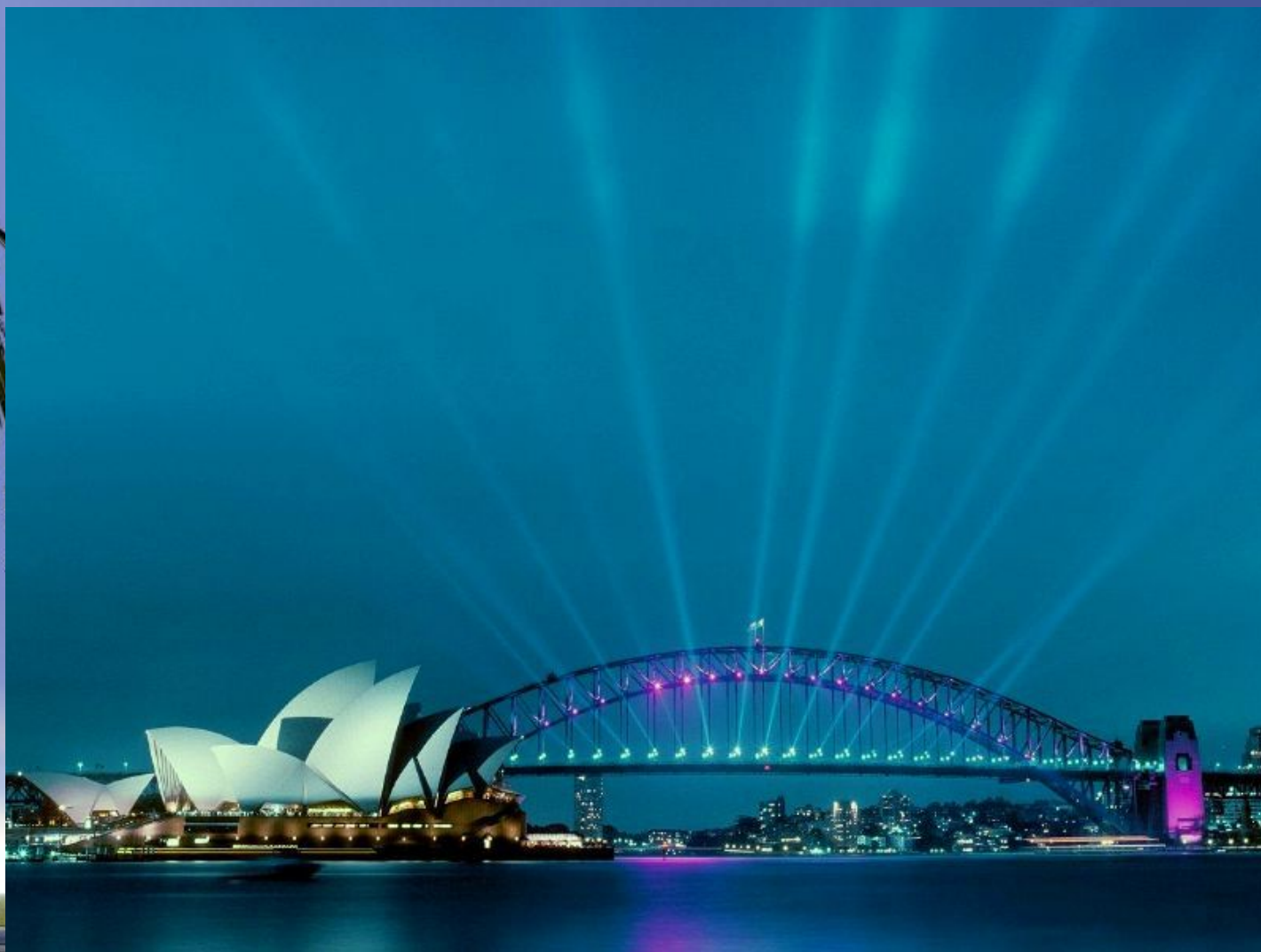
The Harbour Bridge