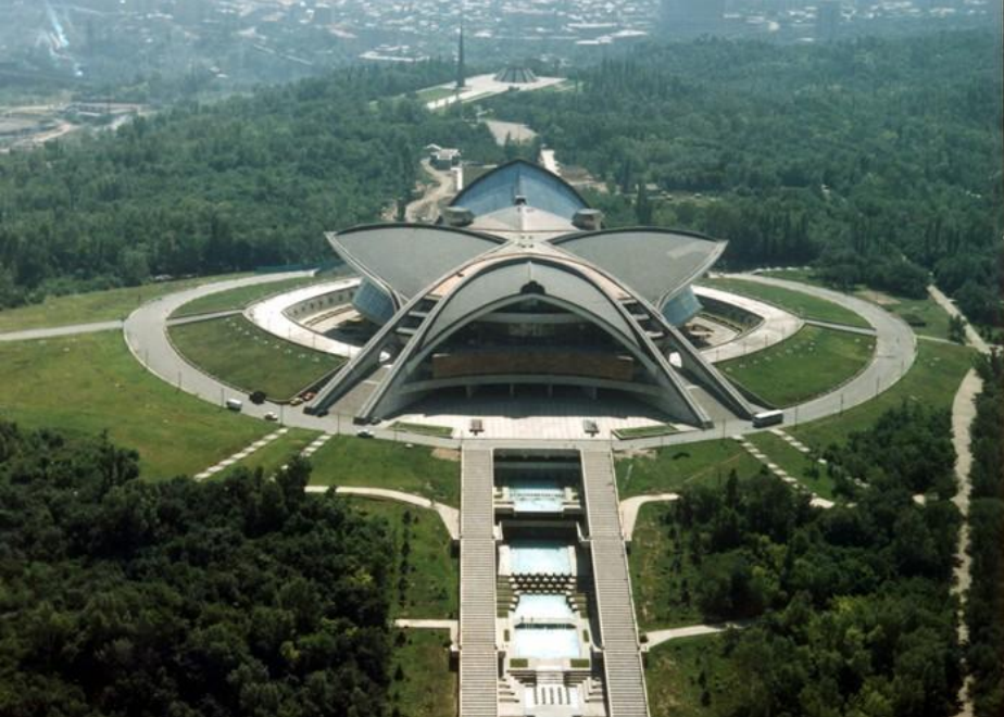
Sports and Concert Complex