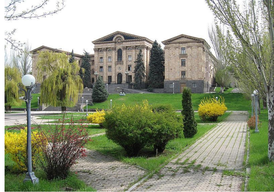
Building of National Assembly of Armenia