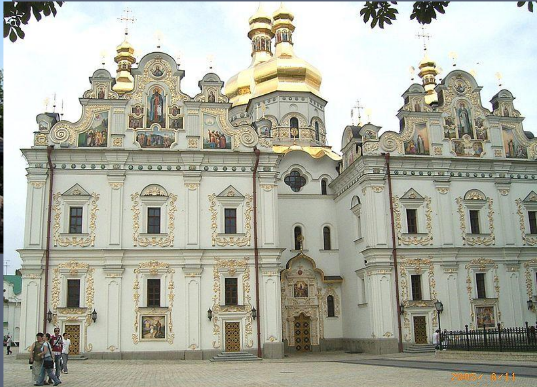
The Cathedral of the Dormition