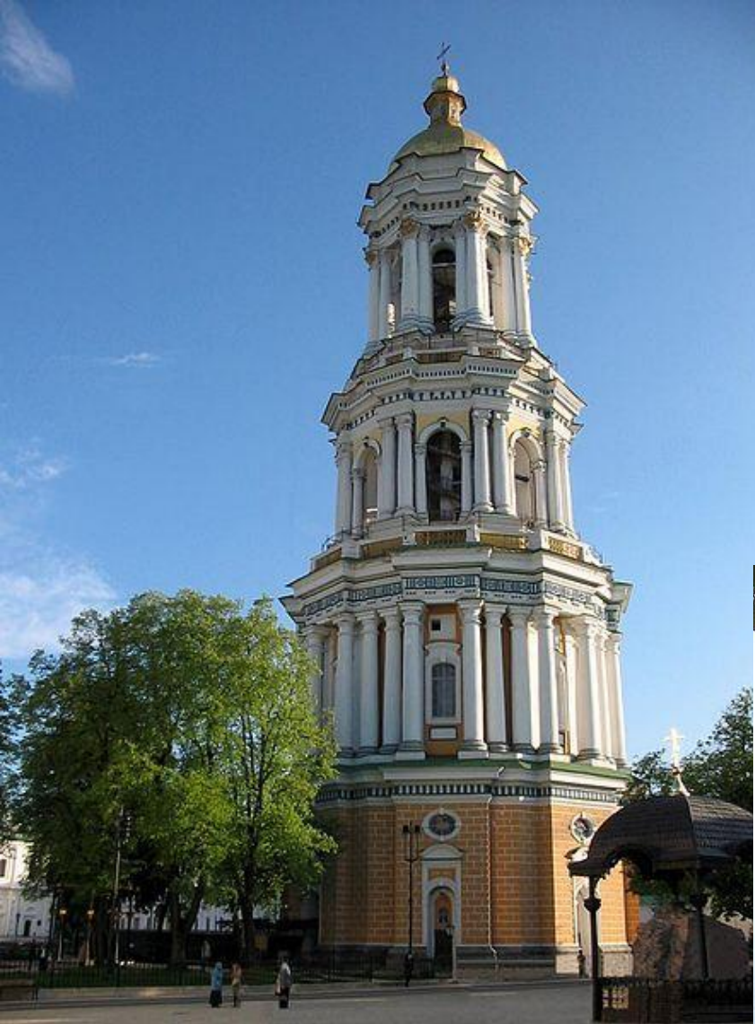
The Great Lavra Belltower