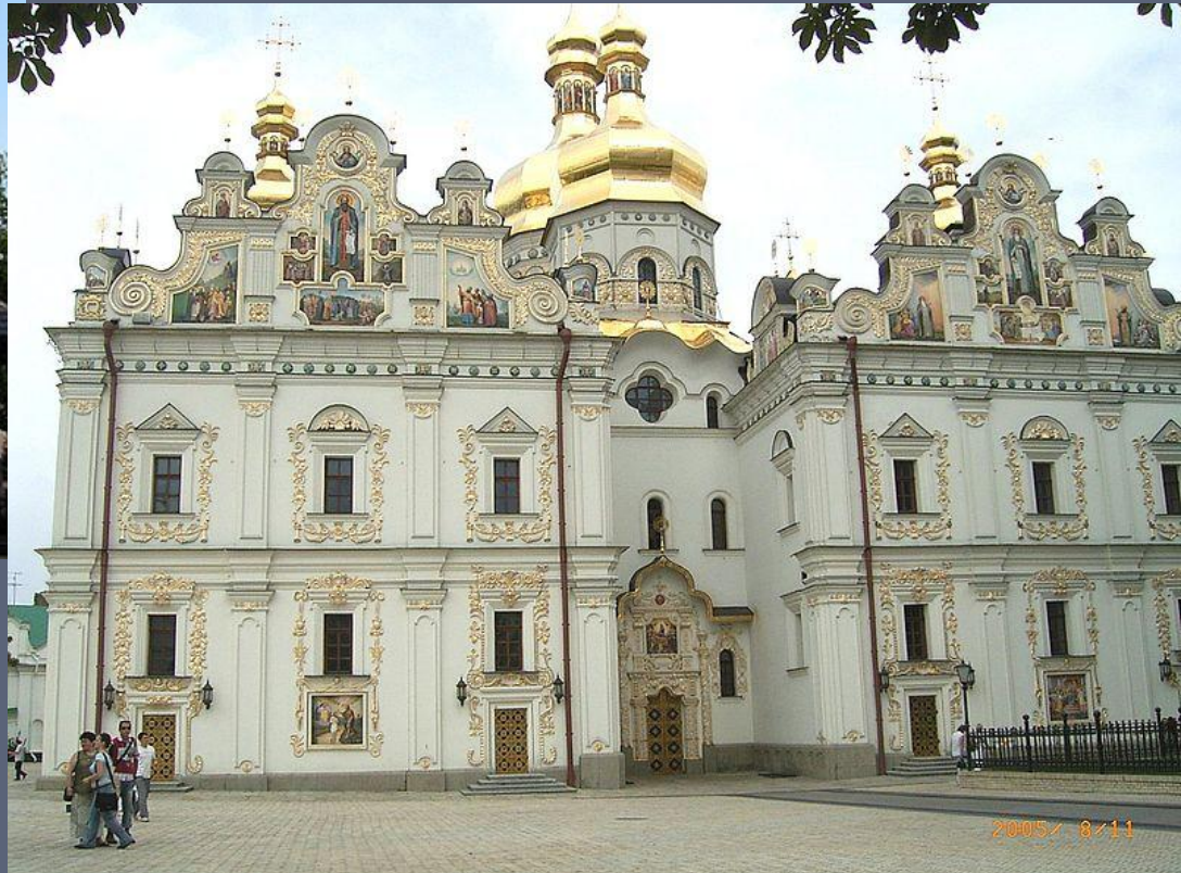
The Cathedral of the Dormition