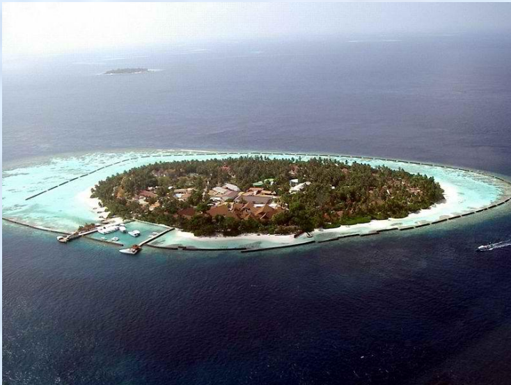
Kurumba Island, Maldives