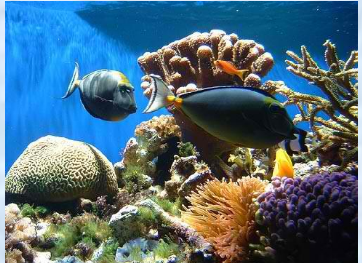
Jamaican coral reef scene