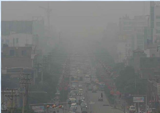
Linfen, China The most polluted city in the world