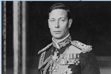
King George VI