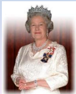
Queen Elizabeth II