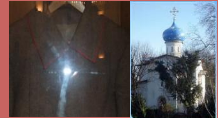
Tsar Nicholas ' greatcoat is kept in Russian Church in London