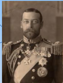
King George V