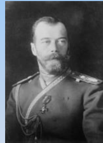
Tsar Nicholas II