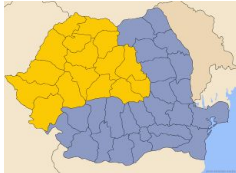
Yellow color is Transylvania

Vampires occupy an important place in folk-lore traditions of this earth. Count Drakula . For millions of people this name is related to appearance of legendary vampire from gloomy and enigmatic countries of Transylvania.