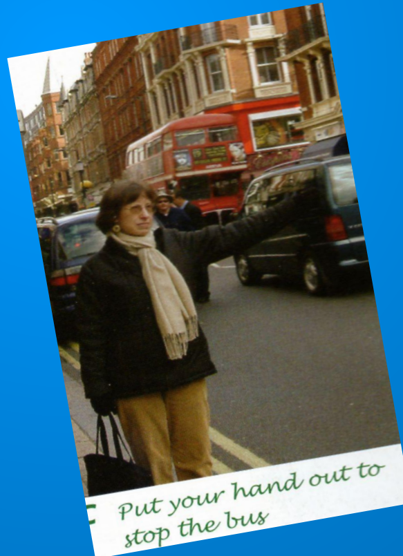
C Put your hand out to stop the bus