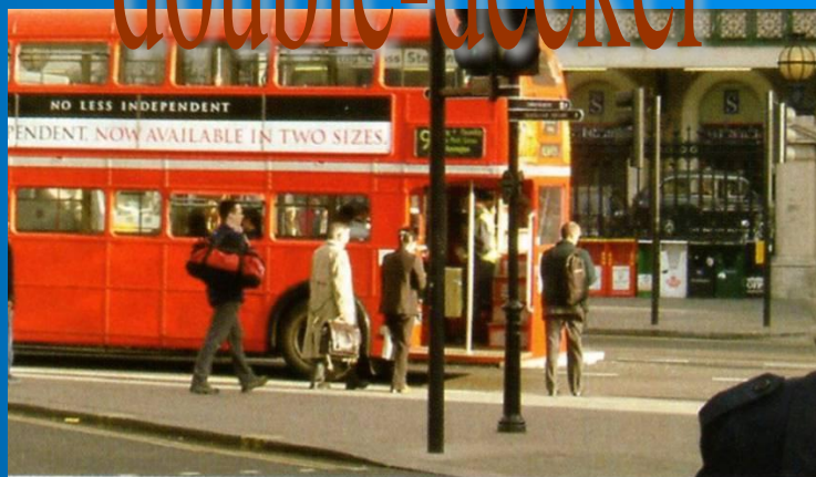
A A good way to see the city