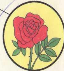
The symbol of England is a rose.