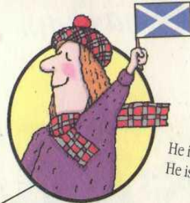
He is Scottish. He is from Scotland.