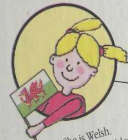
She is Welsh. She is from Wales.