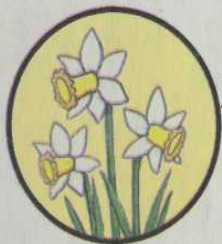
The symbol of Wales is a daffodil.