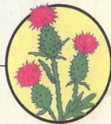
The symbol of Scotland is a thistle.