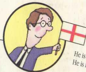
He is English. He is from England.