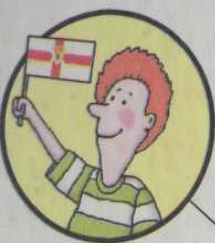
He is Irish. He is from Northern Ireland.