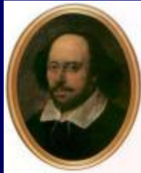
W. Shakespeare (