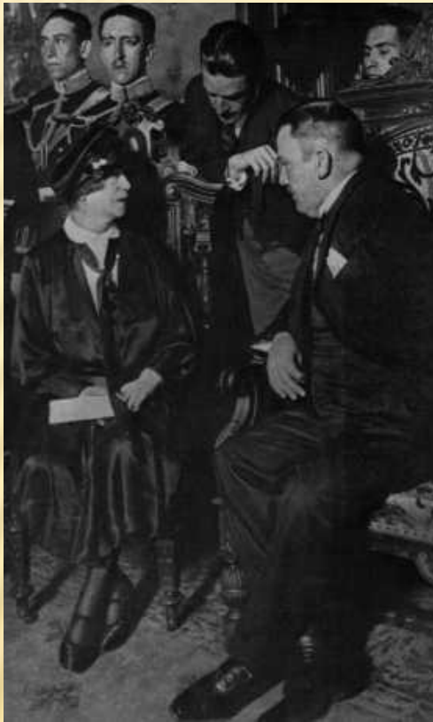
1926: Witt Mexico President Elias Calles