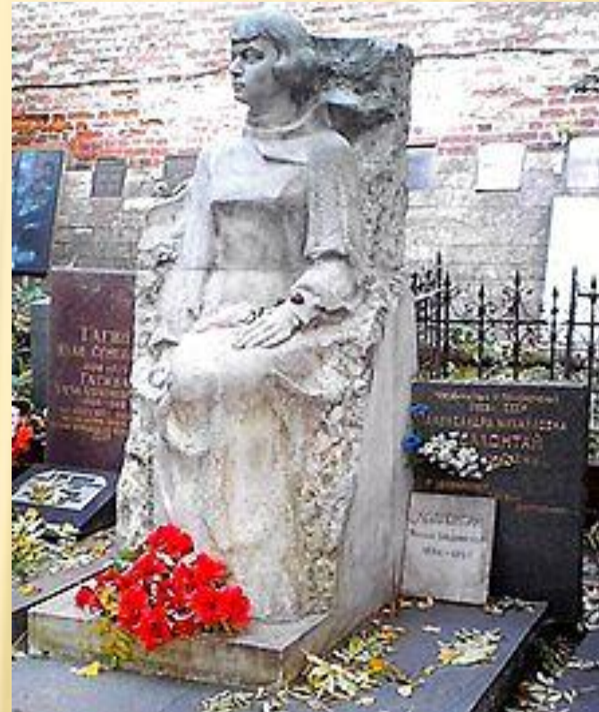
Grave of Kollontai at the Njvodevichy Cemistry in Moscow.