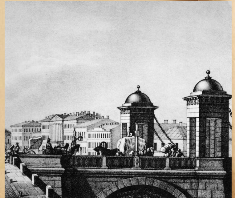
Съ картинъ, находящихся въ приемномъ залѣ Собственнаго Е. И. В. Анничкина дворца.