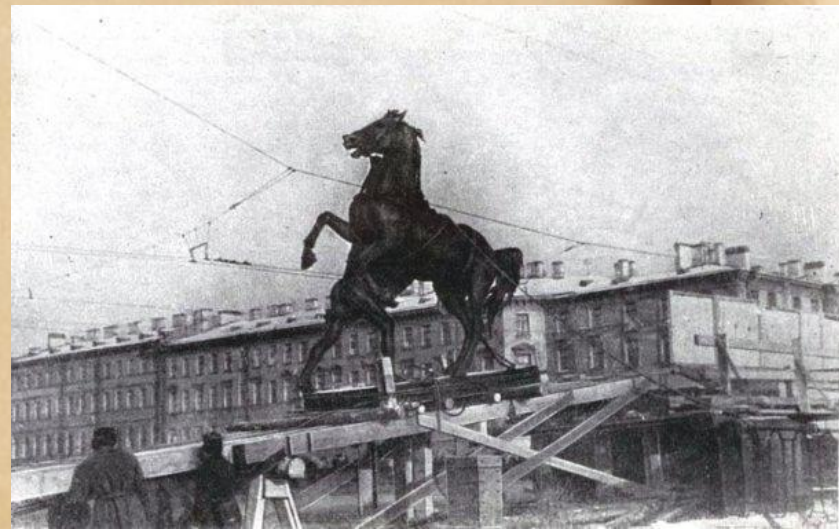
Снятие скульптур Клодта с Аничкова моста. 1941 г.