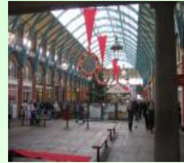
Harrods in Knightbridge