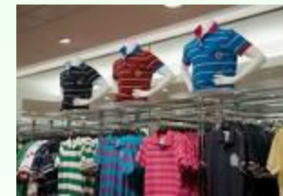
King's Road in Chelsea