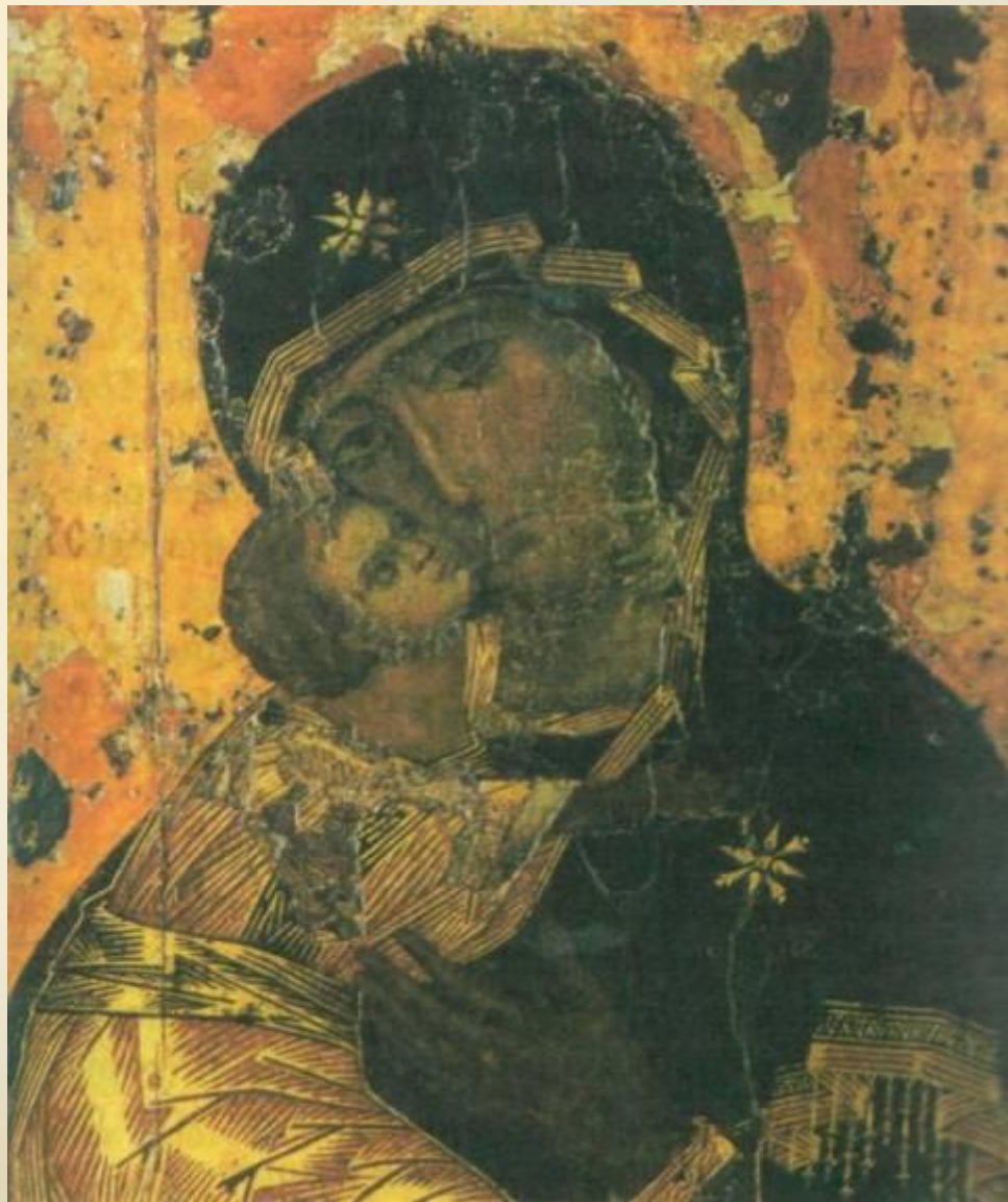
Владимирская икона Божией Матери.