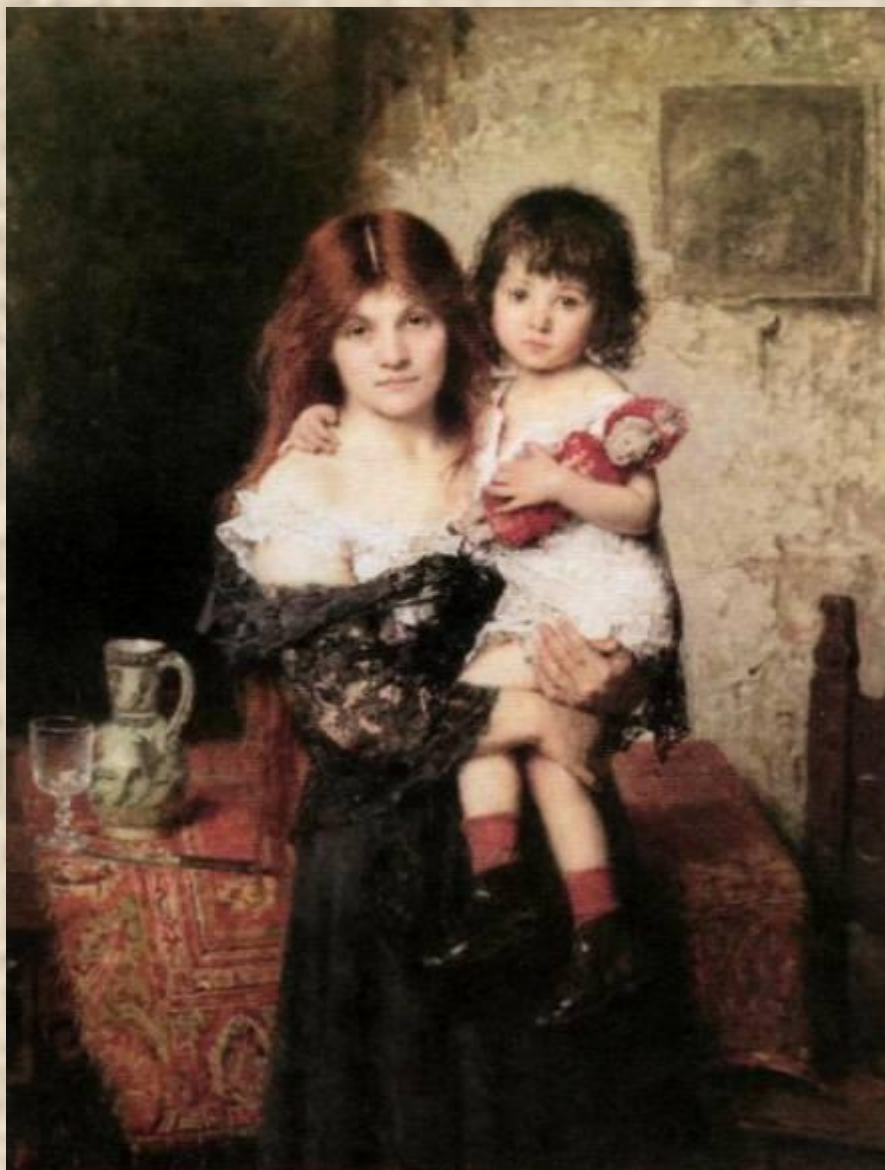
Мать и дочь. А.Харламов.