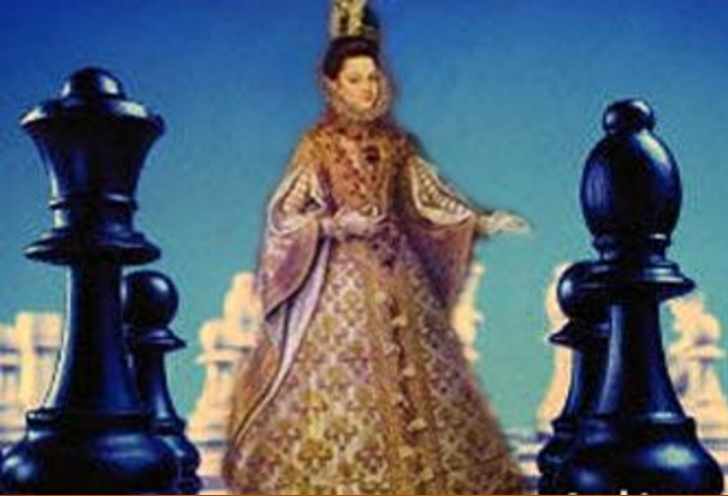
QUEEN OF SPAIN