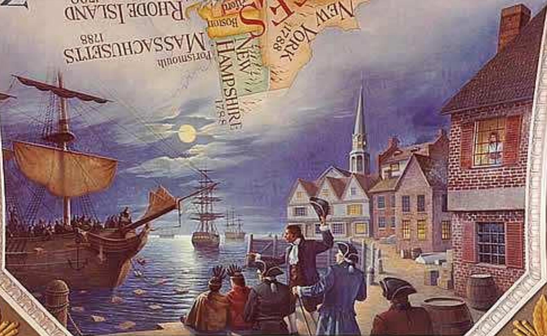
BOSTON TEA PARTY. 1773

NEW JERSEY 1787 TRENTON NEW YORK HARTFORD CONNECTICUT 1788 PROVIDENCE RHODE ISLAND 1790 MASSACHUSETTS 1788 PORTSMOUTH NEW HAMPSHIRE 1794 NEW YORK 1788 PENNSYLVANIA 1787 PHILADELPHIA WEST VIRGINIA CONNECTICUT RESERVE