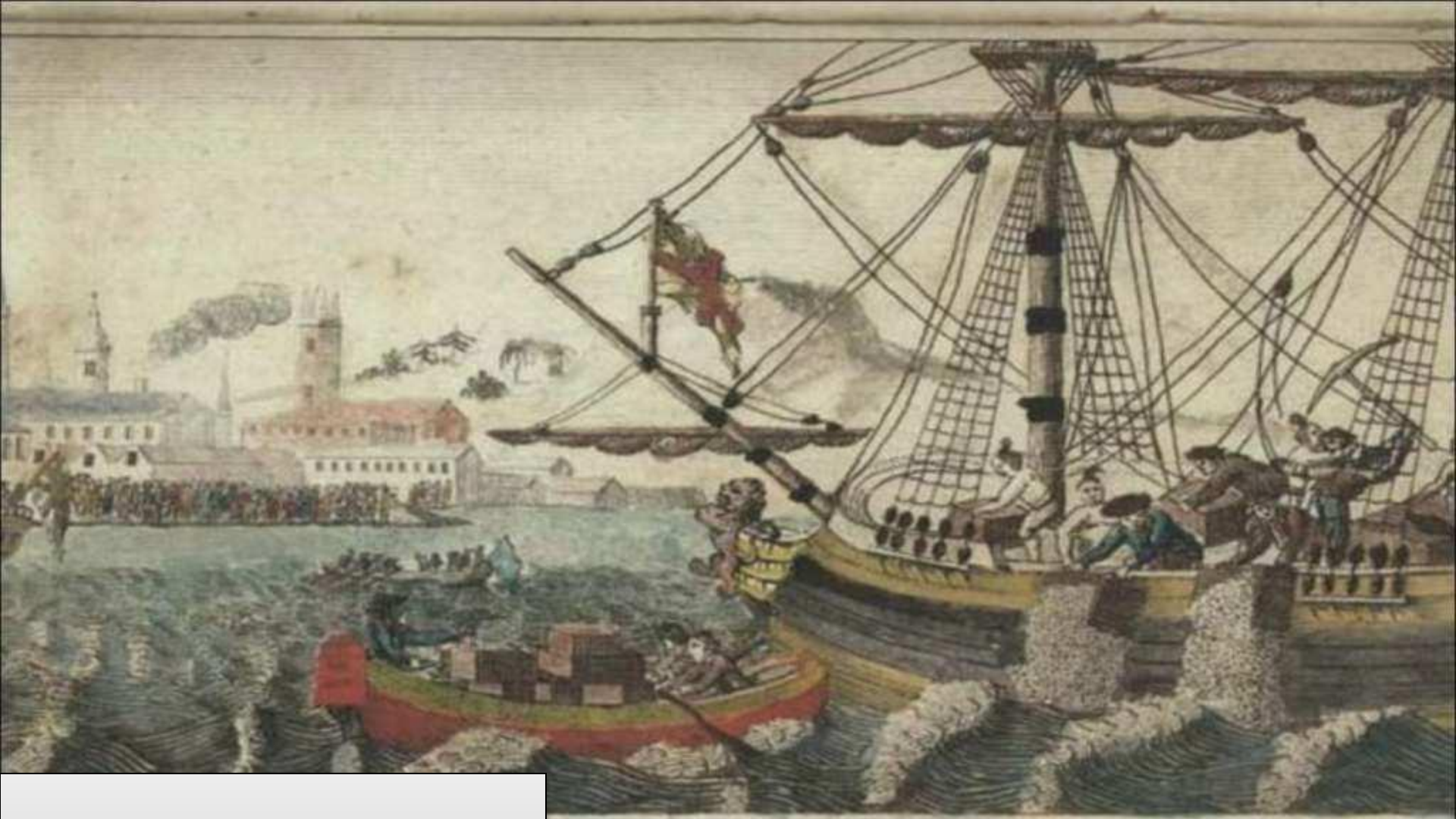
Cargoes of the Tea Ships into the River, at Boston