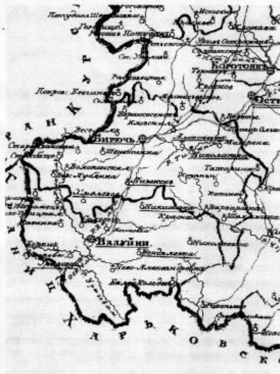
ВОЕННО-ТОПОГРАФИЧЕСКАЯ КАРТА, 1948 год