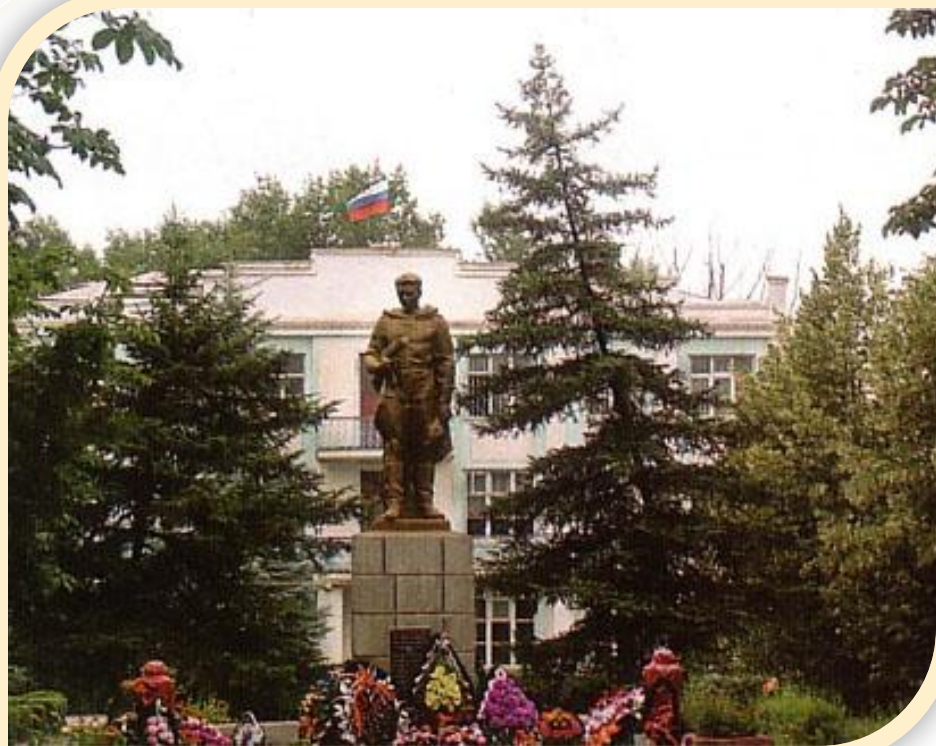
The Monument to the Unknown Soldier.

A lot of people come here to honour and remember in the peaceful times the fallen heroes, to know and understand the past and the future