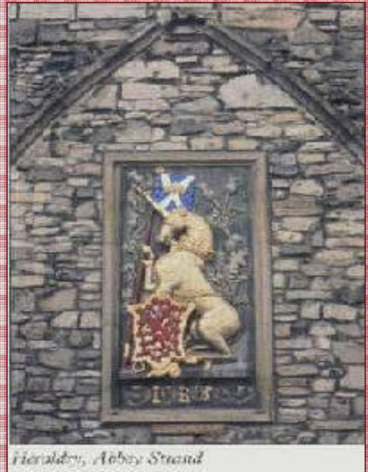
Heralds, Abbey Strand