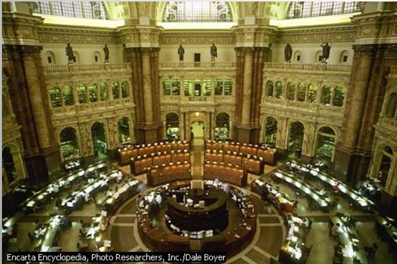
Encarta Encyclopedia, Photo Researchers, Inc./Dale Boyer

The present collection of the Library of Congress began with the purchase of Jefferson's personal library.