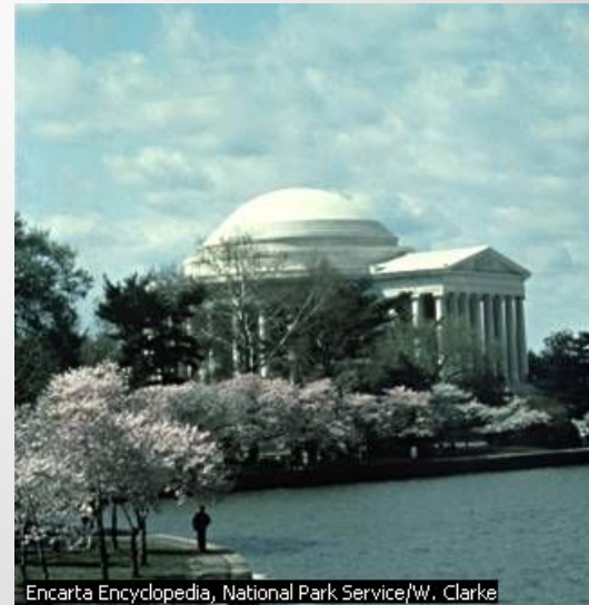
Encarta Encyclopedia, National Park Service/W. Clarke