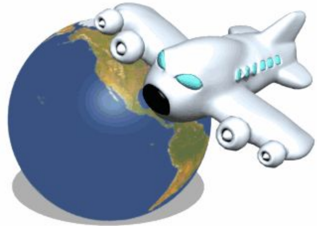
Tom's plane Tom