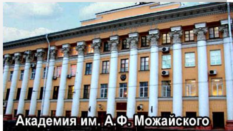
Академия им. А.Ф. Можайского