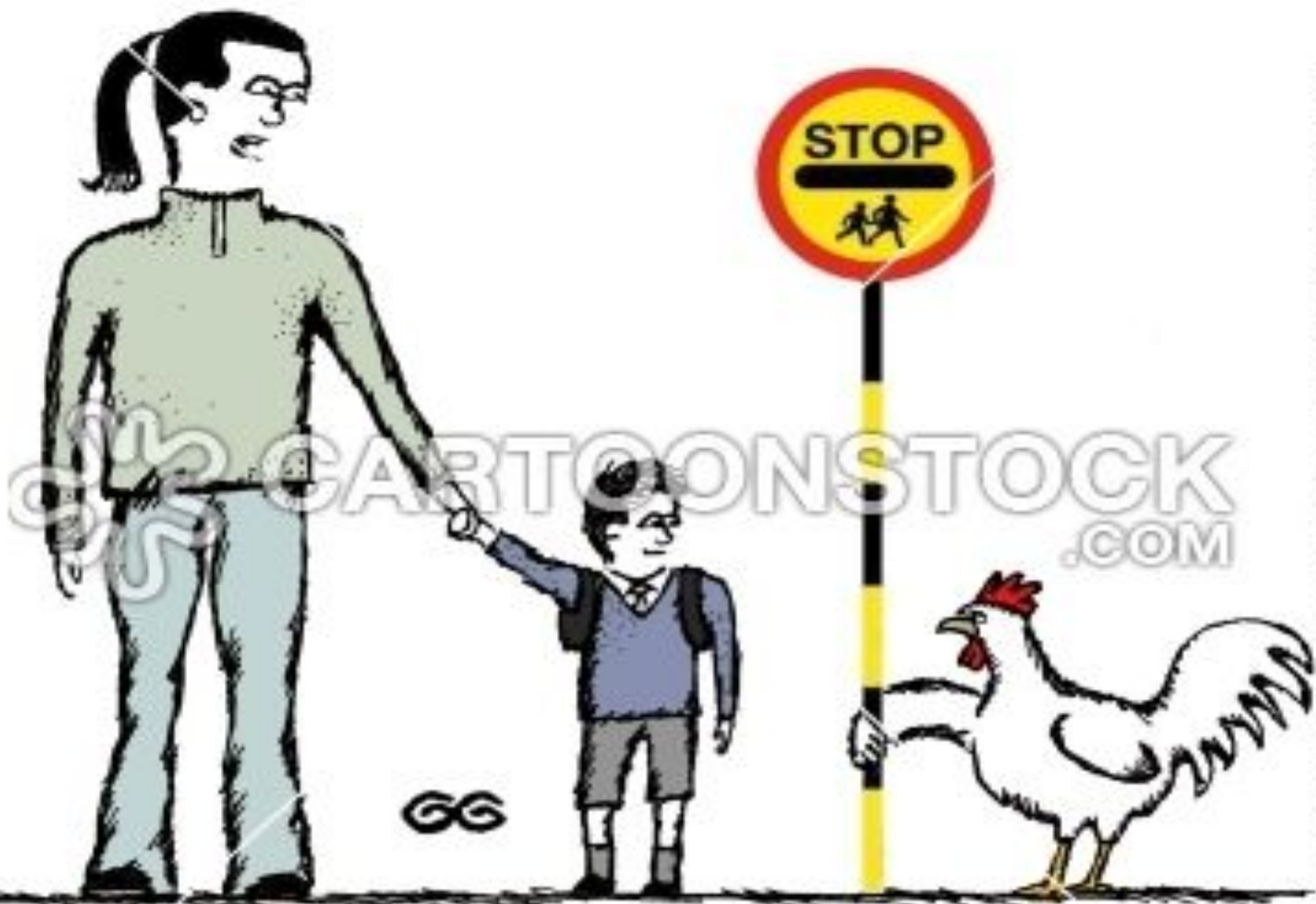
'SO, ALL YOUR TRIPS CROSSING THE ROAD FINALLY PAID OFF?!'