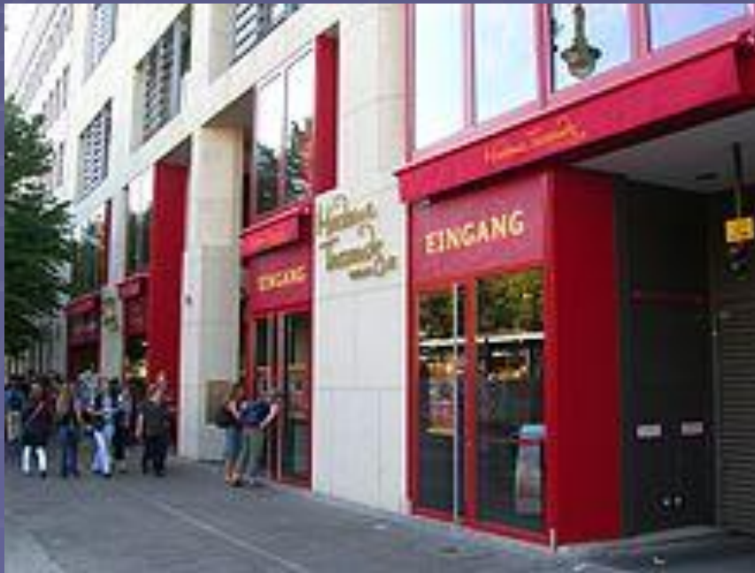
Entry of Madame Tussauds in Berlin