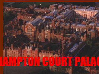
HAMPTON COURT PALACE