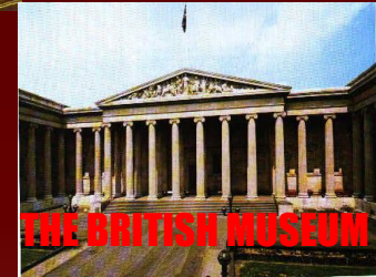
THE BRITISH MUSEUM