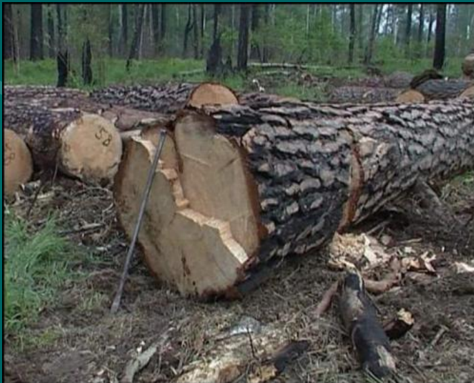
Trees are cut down