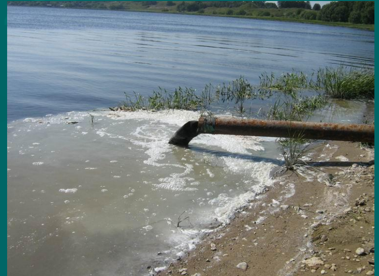
Water and land pollution