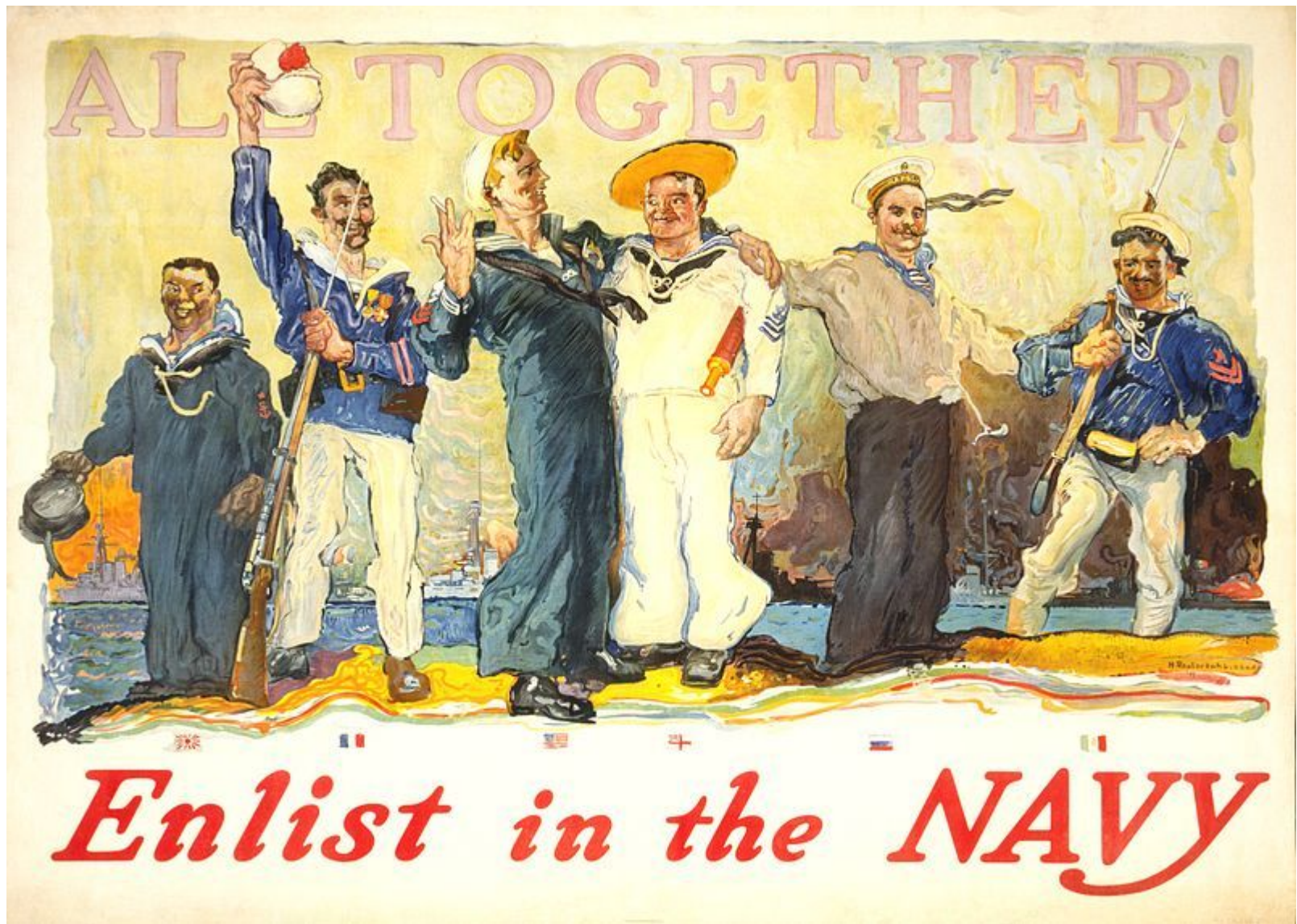
Naval recruitment poster (1917)