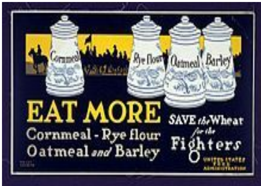
Food Administration poster 1917