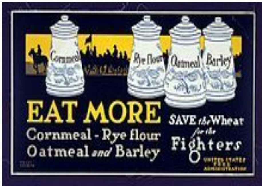
Food Administration poster 1917