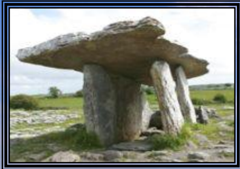
Poulnabrone dolmen, Ireland.