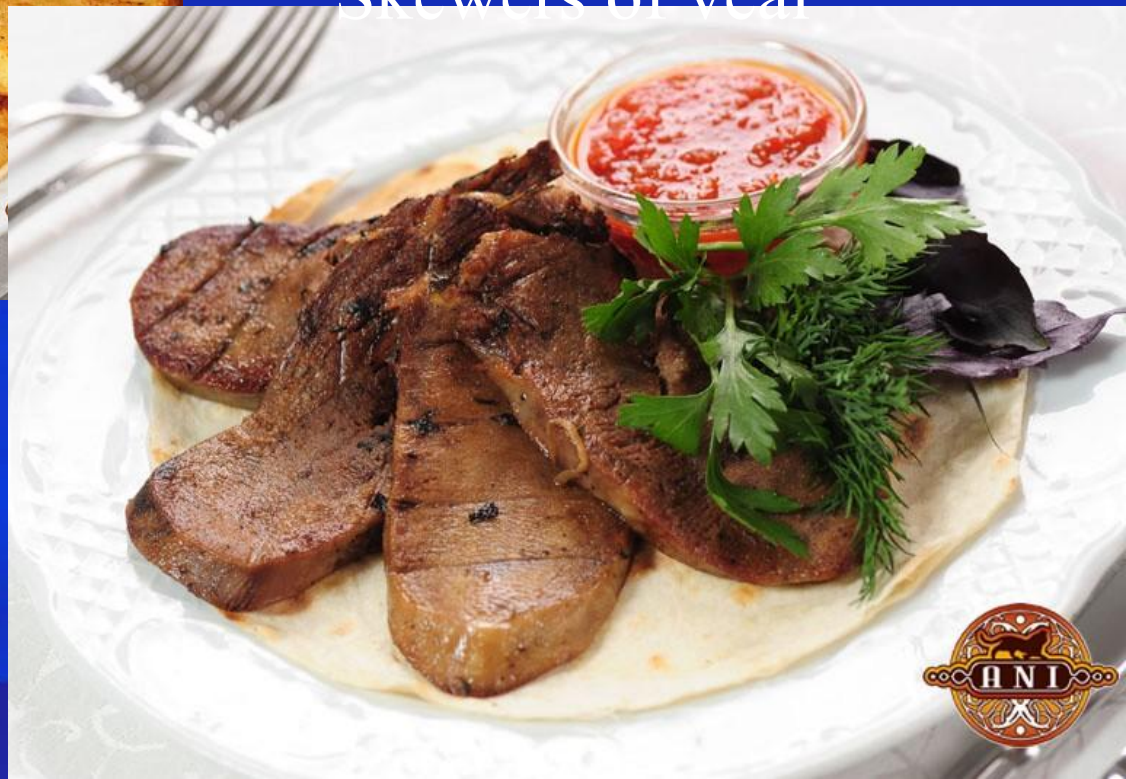
Skewers of veal