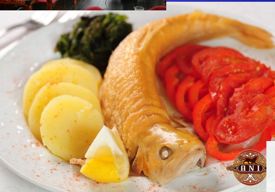
Sturgeon in Armenian with vegetables