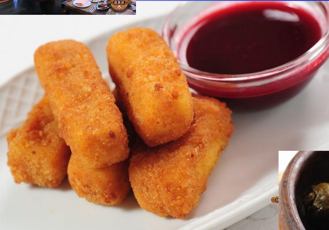
Potatoes in the tandoor