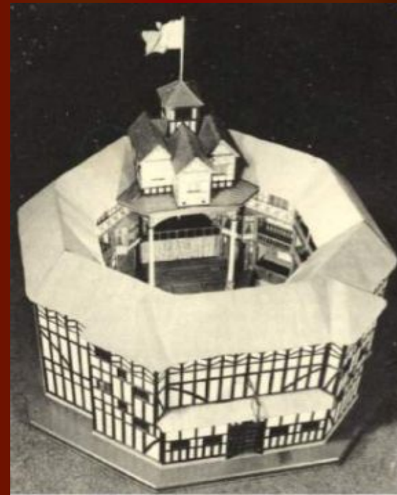
Top view of Shakespeare's Globe Theater