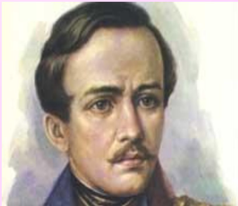
М. Ю. Лермонтов

Касаясь земли она Ей снится прекрасная палата Водяной восточной земли растущая тихо и грустно На жаркой песчаной саване Ein Fichtenbaum steht einsam Von Norden auf Kakler Höhe. На холодной и голубой вершине Стоит одиноко сосна, И дремлет... под сенью какая дремлет она, пугливой Ей снится прекрасная палата Водяной восточной земли растущая тихо и грустно На жаркой песчаной саване