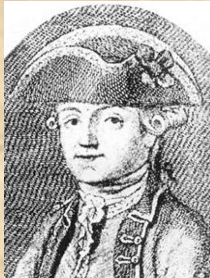
Капитан Джон Байрон, отец Джорджа Гордона Байрона. Гравюра