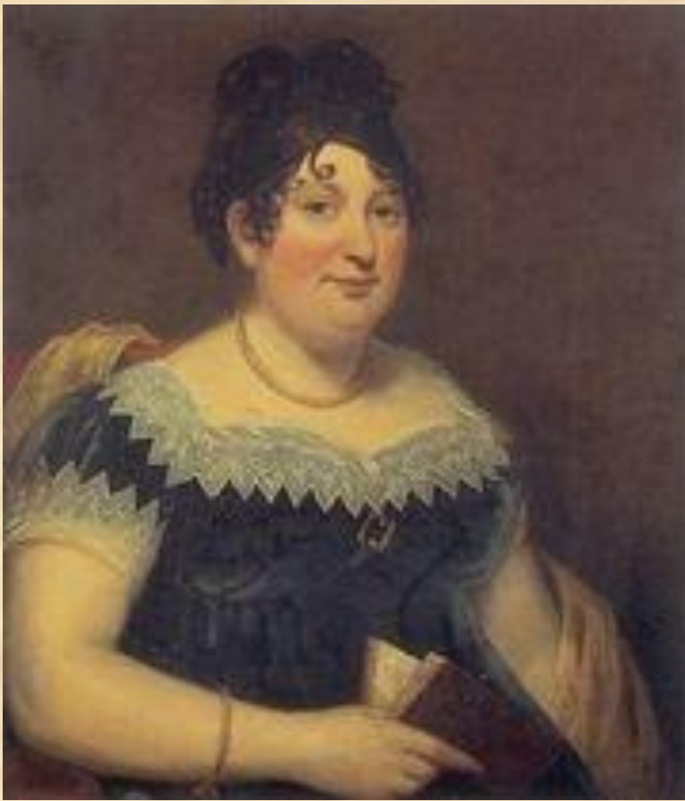
Миссис Байрон, мать Джорджа Гордона Байрона. Худ. Т. Стюардсон.