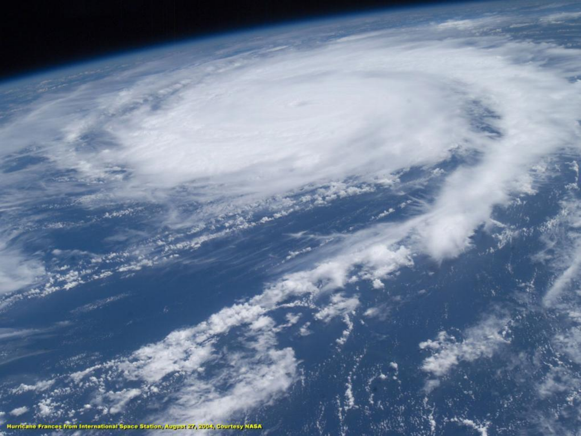
Hurricane Frances from International Space Station, August 27, 2004