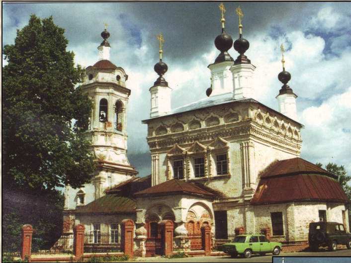
Church of the Protection on the Ditch.