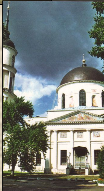
Cathedral of Trinity. Built in 1818. Project by I. Yasnygin.