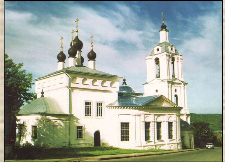
Savior Church over the Top. Constructed in 1700.