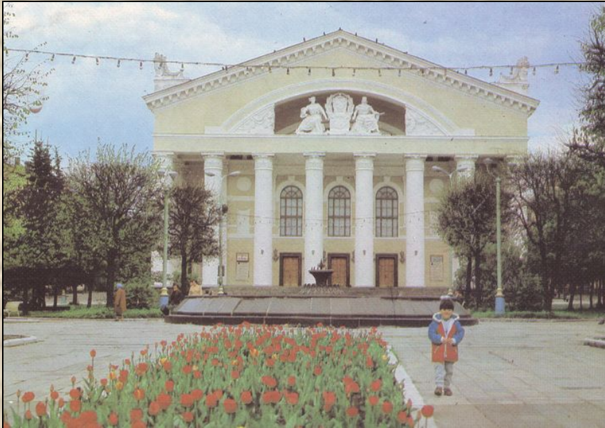
The Drama Theatre named after Lunacharsky.