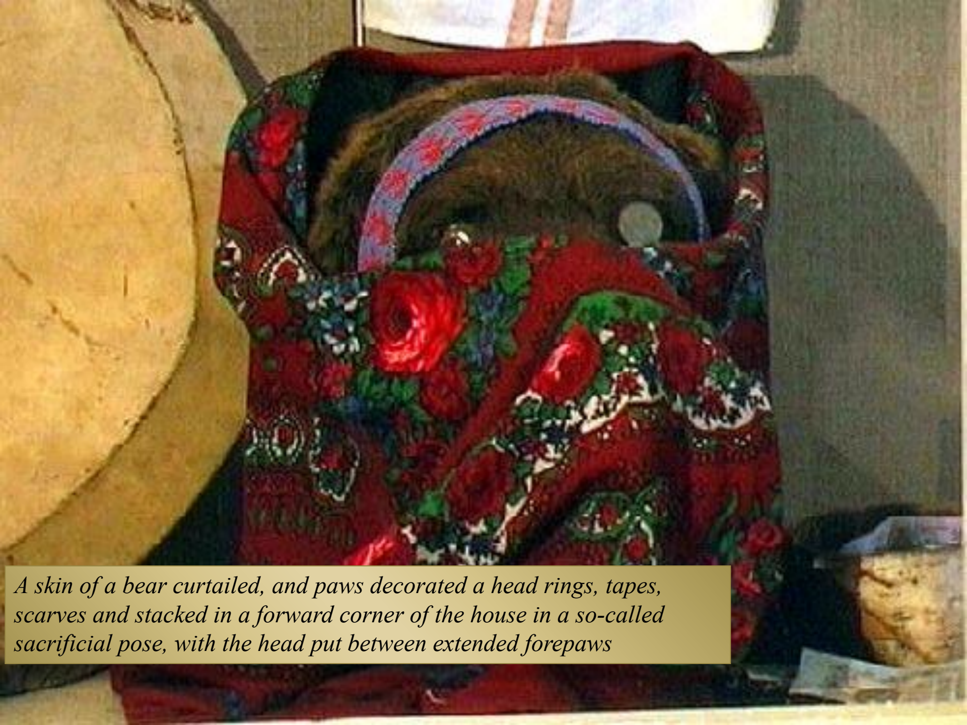
A skin of a bear curtailed, and paws decorated a head rings, tapes, scarves and stacked in a forward corner of the house in a so-called sacrificial pose, with the head put between extended forepaws