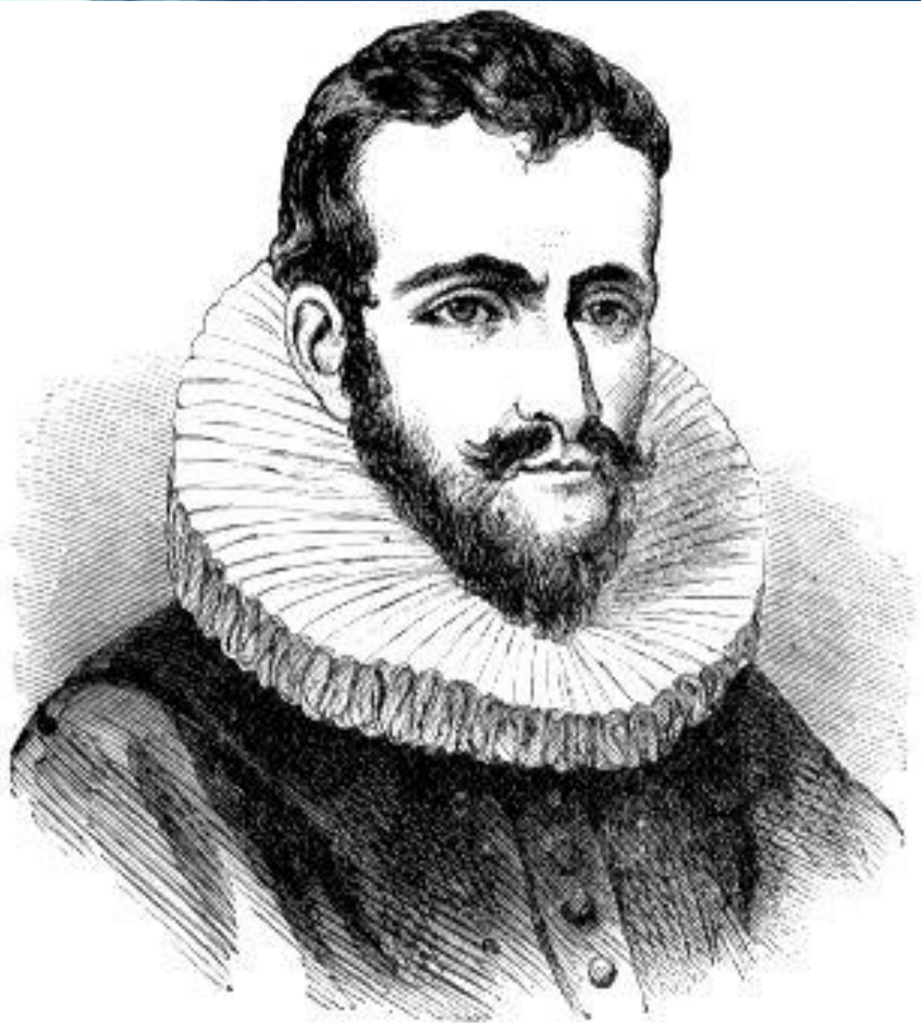
SIR HENRY HUDSON.

The mighty Hudson River is named after the navigator Henry Hudson.