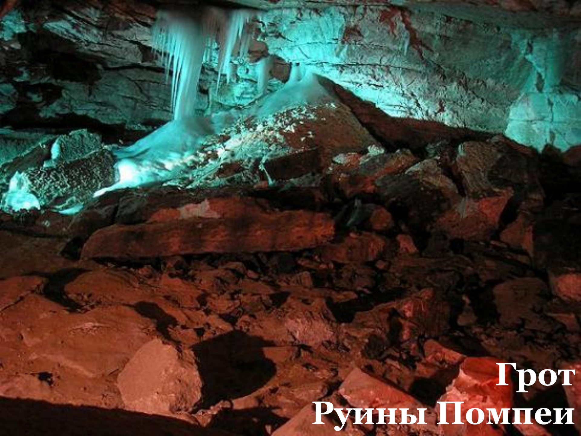
Грот Руины Помпеи