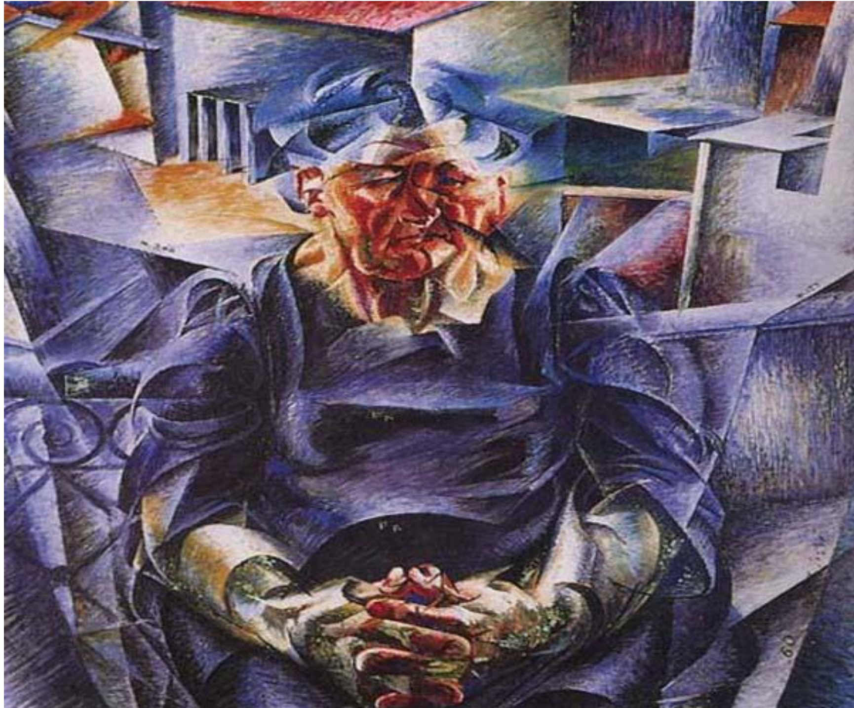
Горизонтальные ритмы (1912)