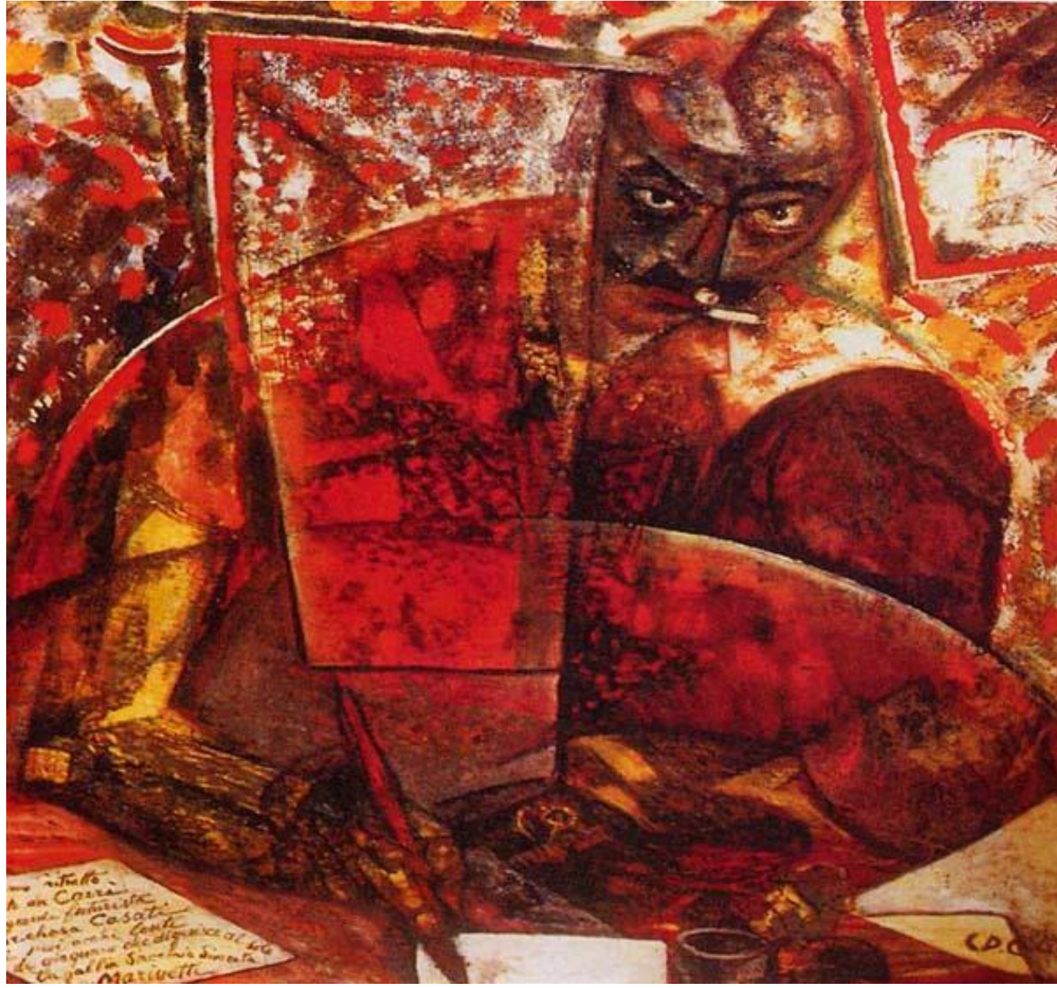
Портрет Маринетти (1910-1911)