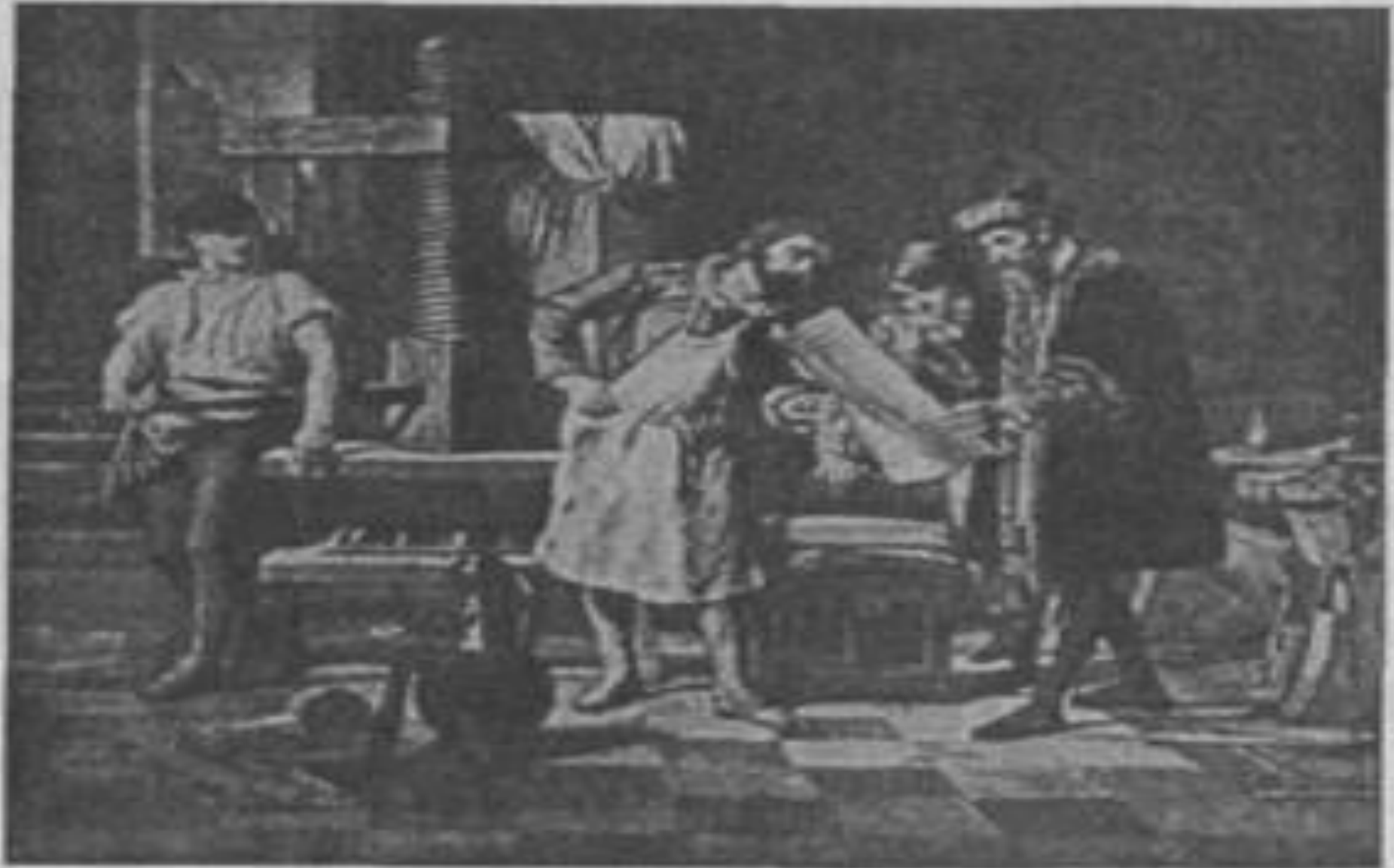
Гуттенберг рассматривает отпечатанную страницу