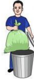
take out the trash