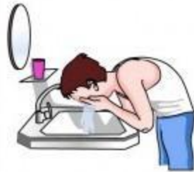
wash your face