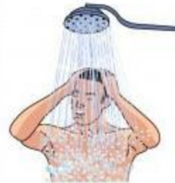
take a shower