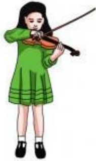
play an instrument