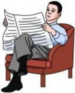
read the paper