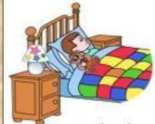
go to bed