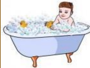
take a bath