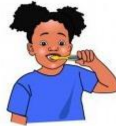
brush your teeth