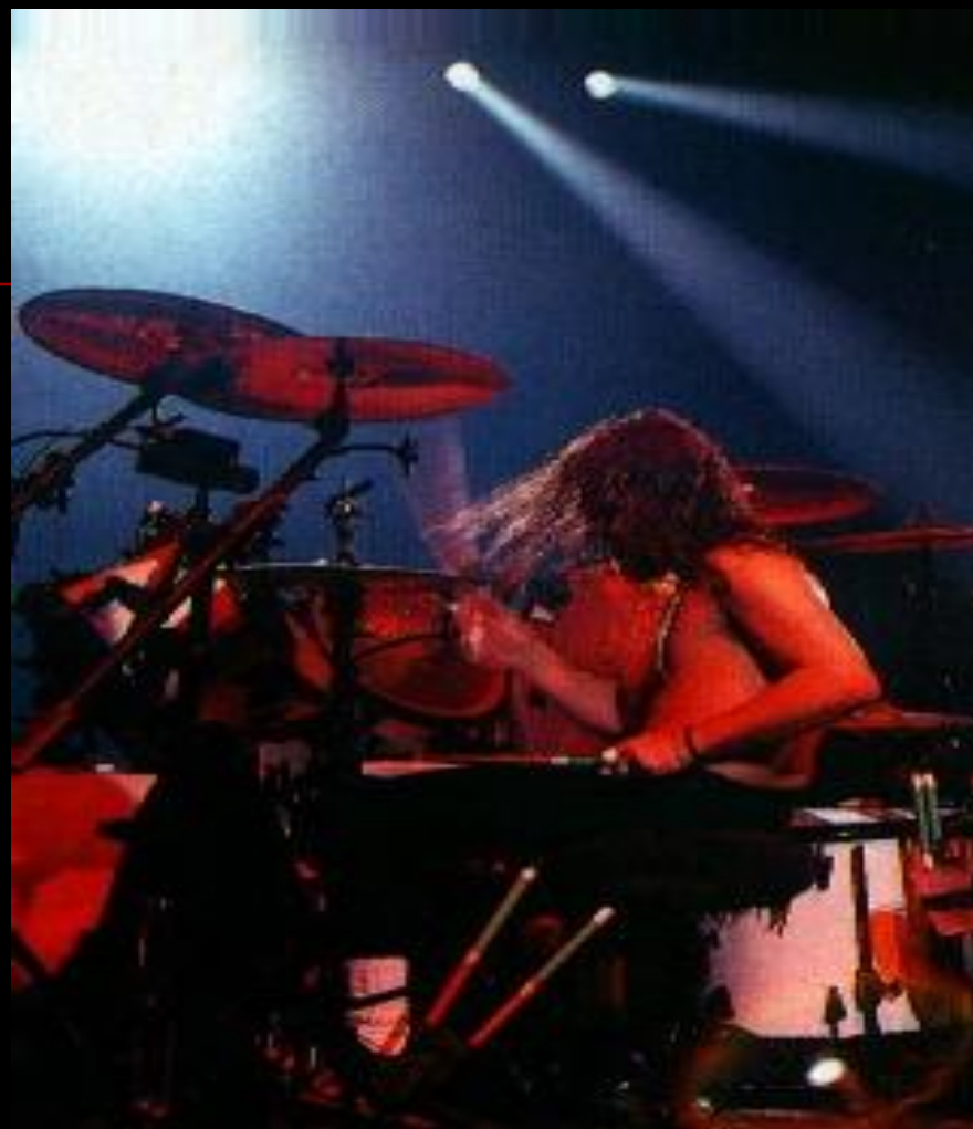
Lars Ulrich, drums (all time)