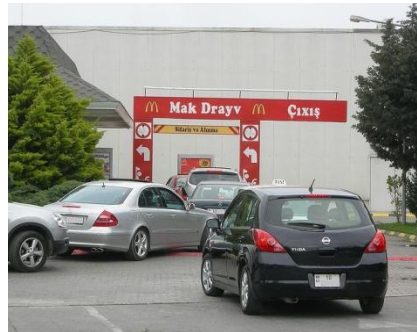
Baku Mak Drayv