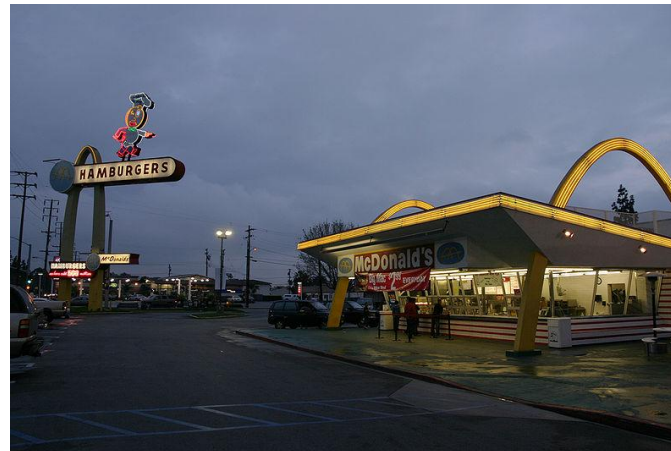
The oldest operating McDonald's restaurant located at Lakewood and Florence Ave in Downey, California