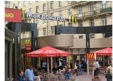
McDonalds in St. Petersburg