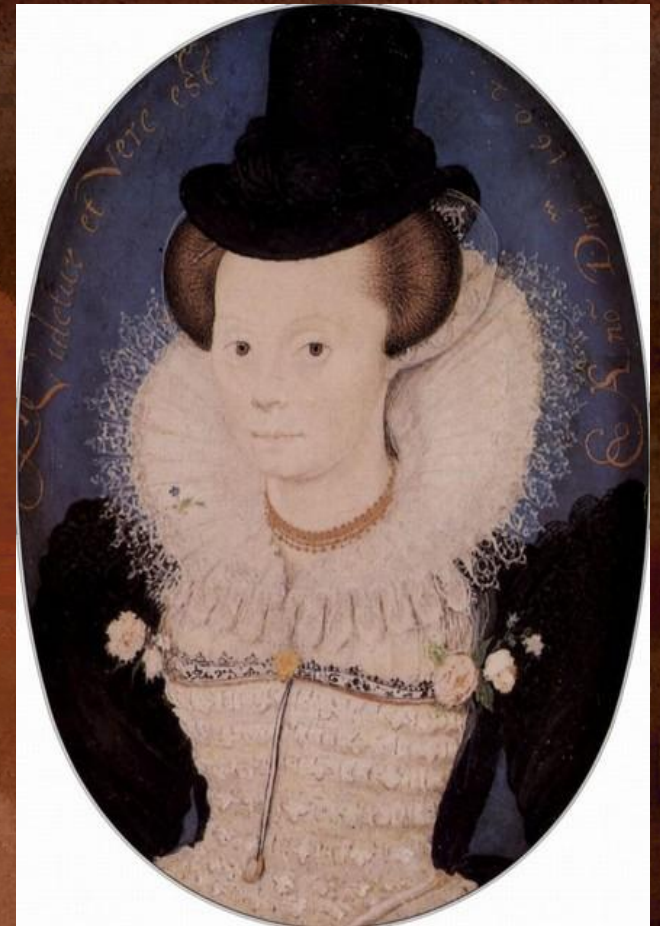
Portrait of the unknown person, 1602, London, Victoria and Albert's museum

The subtlety of performance of Hilliard's works admires. He was able to reproduce thin laces of a collar or a shining jewel.