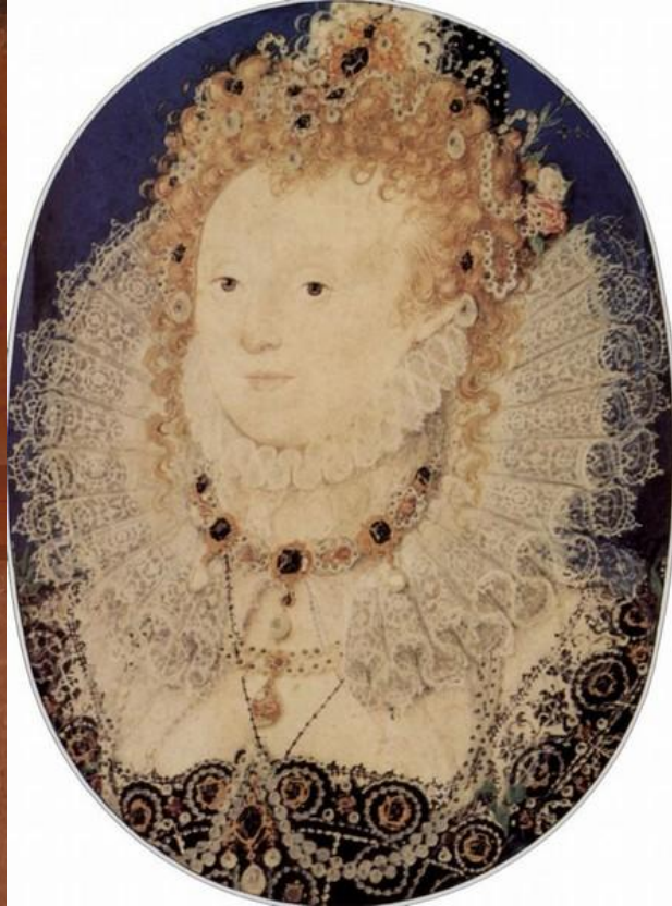
Portrait of English queen Elizabeth I, nearby 1590, Victoria and Albert's London museum

Technically he was very conservative according to European standards, but his paintings are superbly executed and have freshness and charm that has ensured his continuing reputation as "the central artistic figure of the Elizabethian age, the only English painter whose work reflects, in its delicate microcosm, the world of Shakespeare's earlier plays".