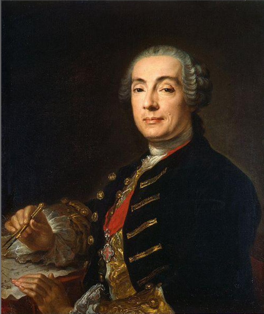
Portrait of Count Rastrelli painted by Lucas Conrad Pfanzelt (1716–1788)