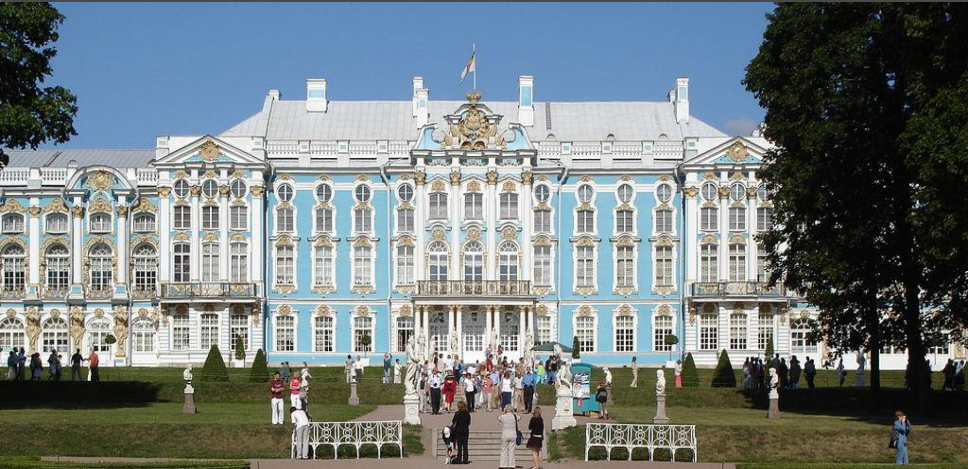
1749-1757 Catherine Palace